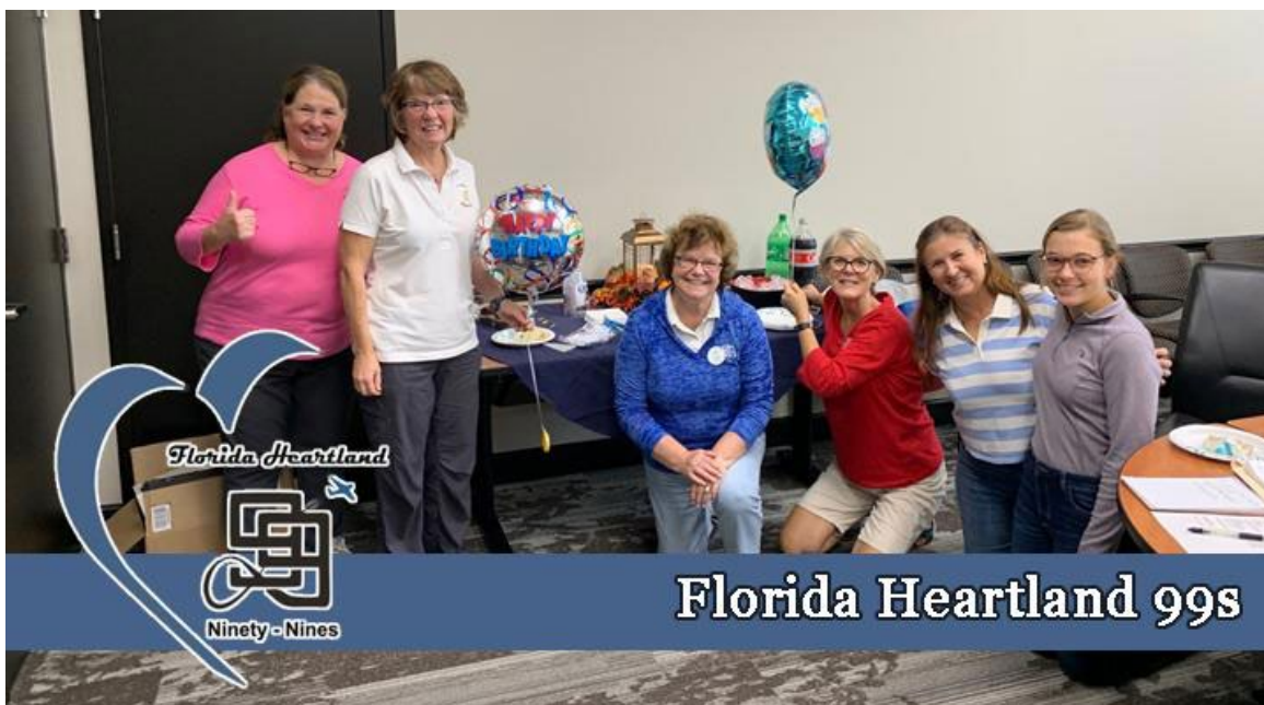
Florida Heartland 99s