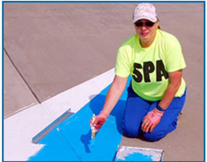
Spartanburg Pilot's Association helping out

BLUE RIDGE: The Blue Ridge 99's with the help of the Spartanburg Pilot's Association after 2 years was able to begin and nearly complete the Compass Rose. The Rose sits on the Apron near the FBO at Spartanburg Airport.