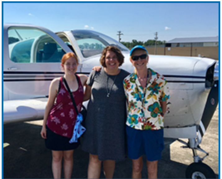
Fuel stop Marion County, AL

Along with meeting some remarkable people, I also got to see how the 99s organization was run. I got to meet almost all the chairwoman who conducted the annual business meeting and even participate in the decisions of the entire organization! Seeing the inner workings of an international organization, with thousands of members, was an amazing opportunity. I cannot describe how inspiring and rewarding it was to be able to participate in this