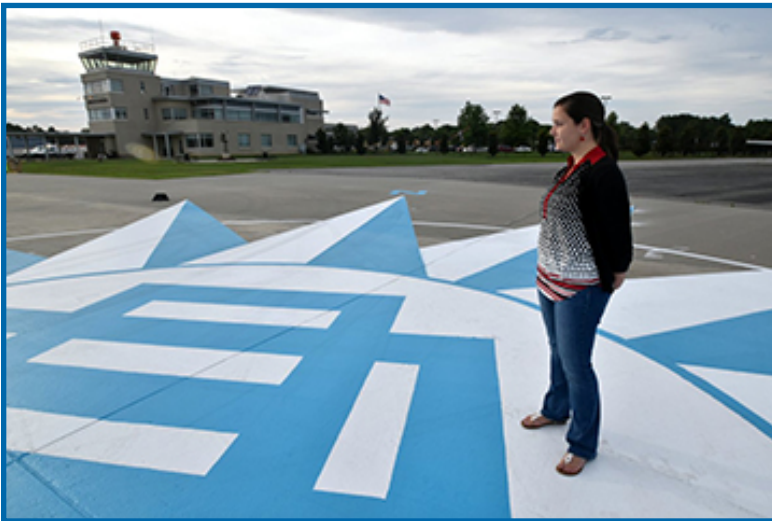
Blue Ridge's Ashley Royale overlooks KSPA Rose