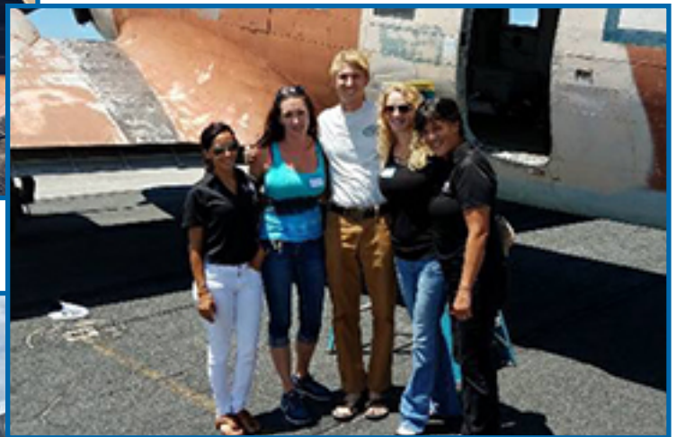
Ladybugs and Paradise Coast DC3 and Tower Tour at Punta Gorda