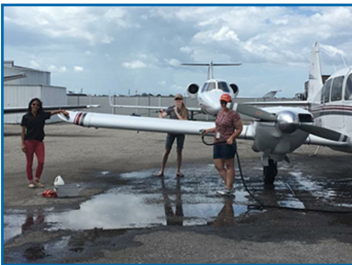
Ladybugs washing planes fundraiser