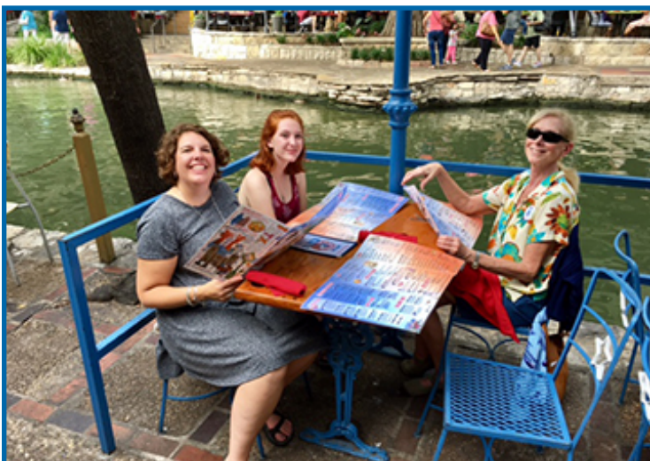
Dinner in San Antonio at Riverwalk