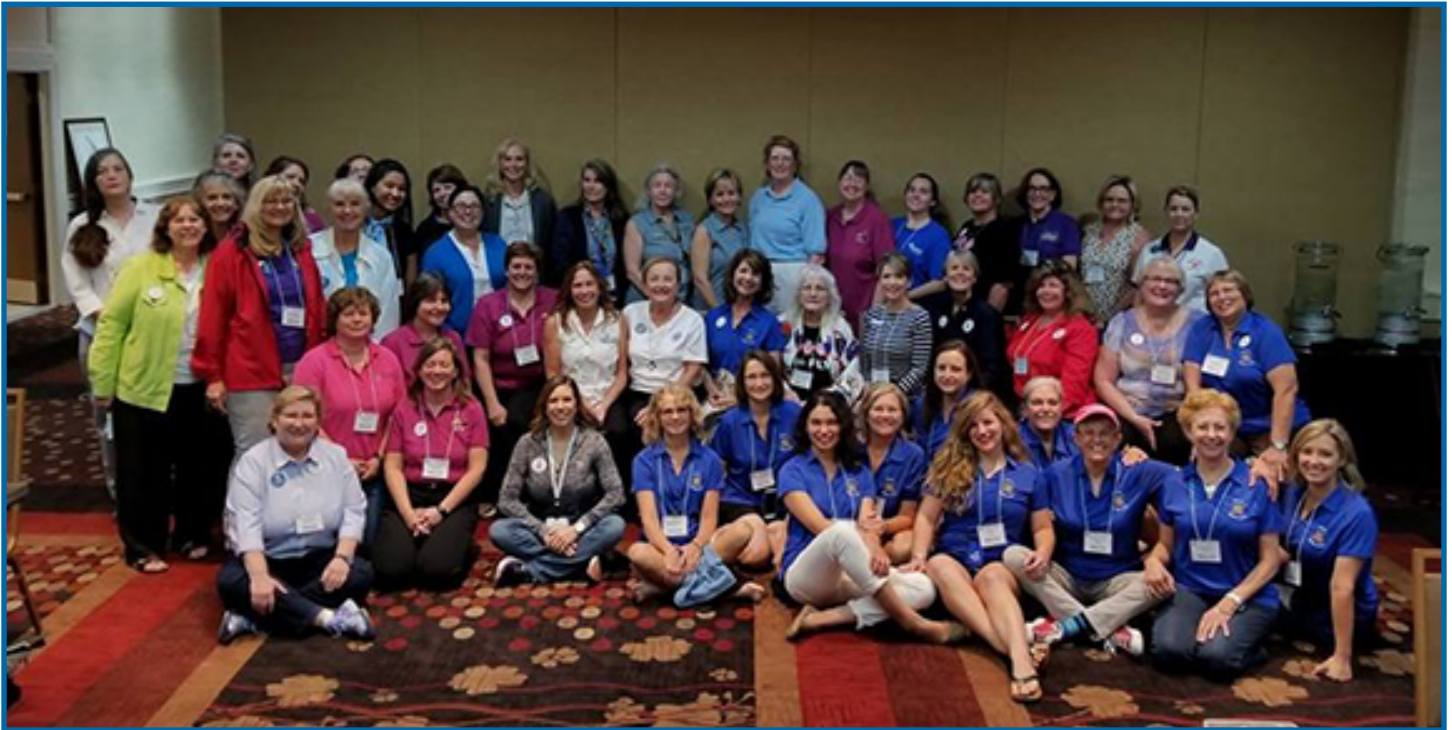
SE Section of the Ninety-Nines at the Fall 2017 Section Meeting in Memphis, TN