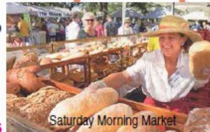
Saturday Morning Market

Registration Form Cut & Send In Before April 1, 2015