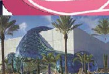
Dalí Museum Museum Fine Arts

Fly into Albert Whitted Airport Downtown Saint Petersburg