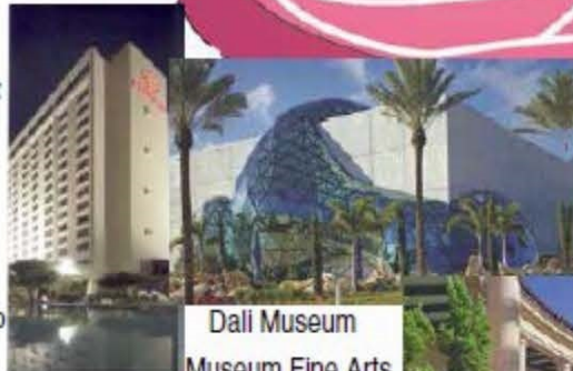
Dali Museum Museum Fine Arts

$131 per night plus $8 parking Make your room reservations by APRIL 14, 2015 mention the 99 SE Conference when you call. Starbucks on site. Tangerine Restaurant offering breakfast, lunch, dinner. The Hilton is walking distance to shopping, museums, and nightlife.