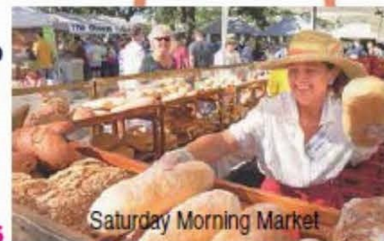
Saturday Morning Market

Registration Form Cut & Send In Before April 1, 2015