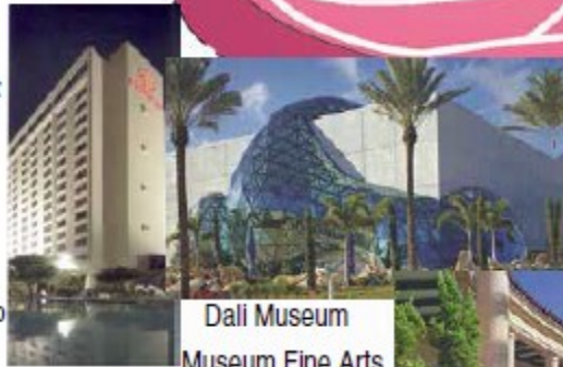
Dali Museum Museum Fine Arts

$131 per night plus $8 parking Make your room reservations by APRIL 14, 2015 mention the 99 SE Conference when you call. Starbucks on site. Tangerine Restaurant offering breakfast, lunch, dinner. The Hilton is walking distance to shopping, museums, and nightlife.