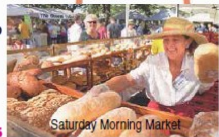
Saturday Morning Market

Registration Form Cut & Send In Before April 1, 2015