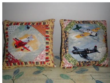
Left—Pillows Above—Quilt Back