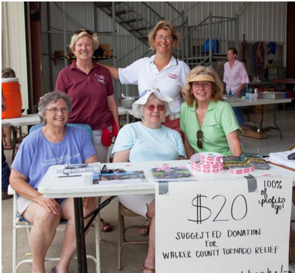
Alabama Chapter members help at Walker County Tornado Relief Fund raiser.