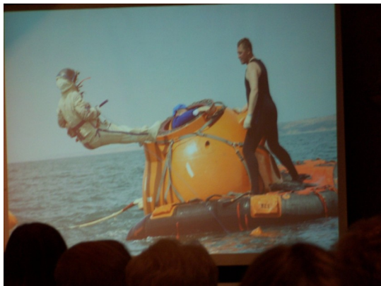
.Shannon Walker training for a water landing in the Russian space capsule

Lunchtime was yummy and our keynote speaker was NASA Astronaut and 99, Shannon Walker. She had a power point presentation about her training years in Russia, and her time on the ISS (International Space Station) She flew to the ISS with the cosmonauts, in a capsule! It reminded me of our earlier years in space.