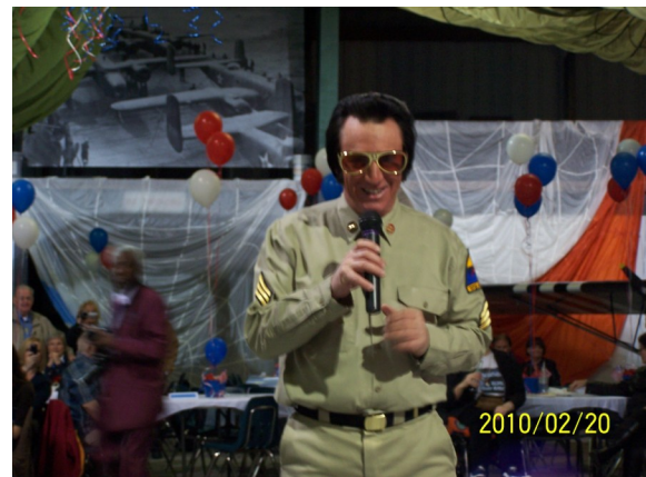
Elvis sarendes the group