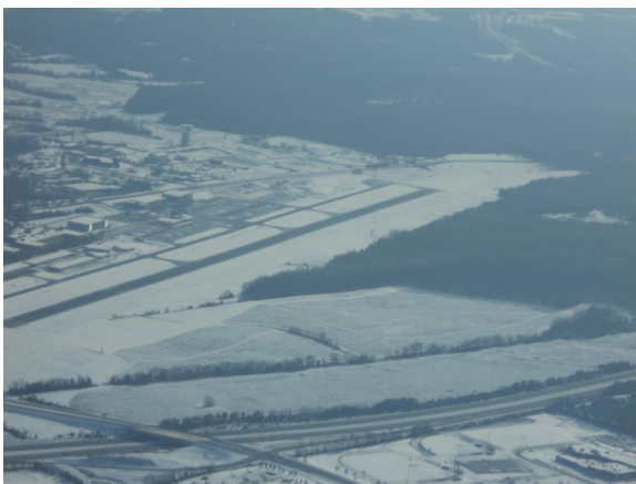
Leesburg, VA blanketed in snow