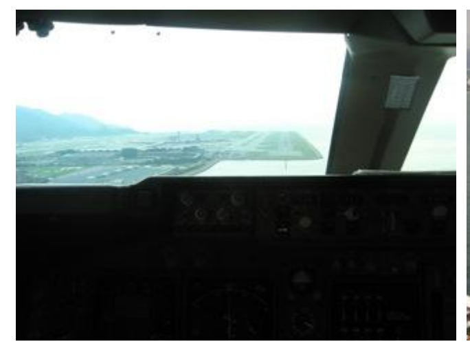
Approach to 25R Hong Kong