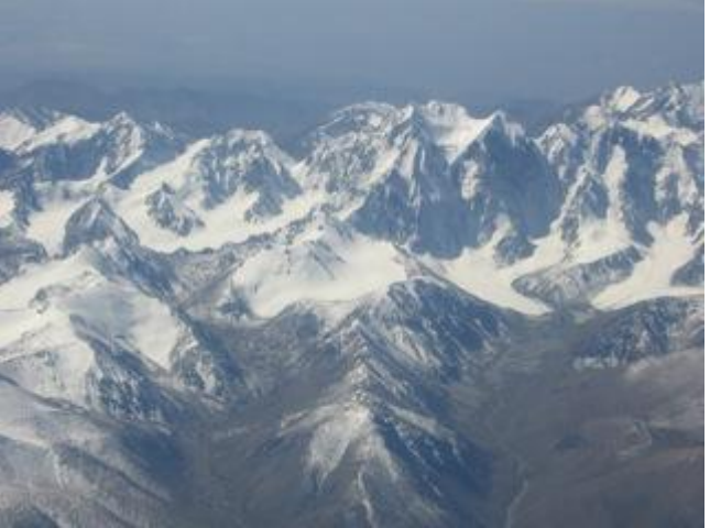
Tian Shan Mountains, near Urumqi, MSA above 22000', airway width only 10.8NM in Chinese Airspace