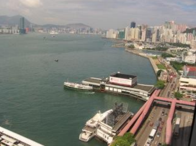
View out my hotel window in Hong Kong, across the Victoria Harbour