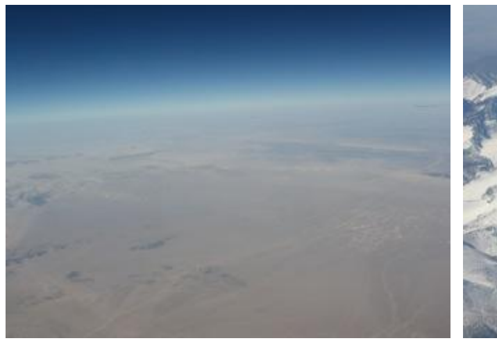
The Gobi Desert to our north